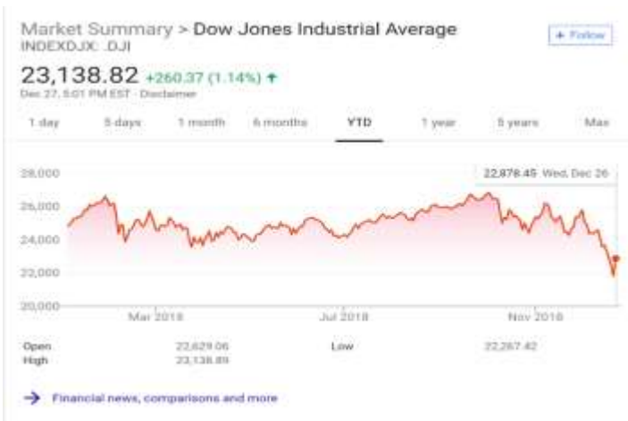
Fig. 3 (which is sitting in his stock account) now has 14% less to deploy. This might result in him having to buy a less expensive golf asset or he may even have to drop out of a deal because his capital has eroded.