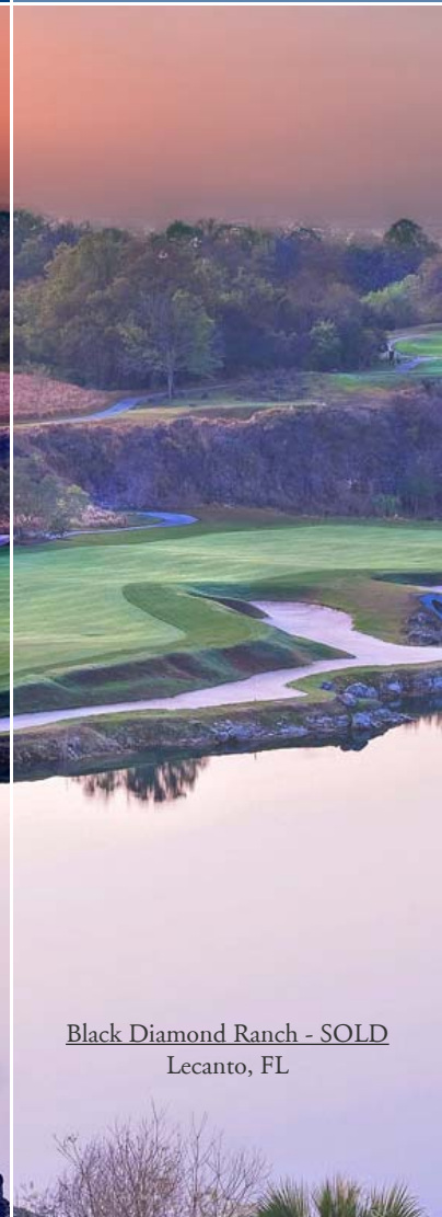
Black Diamond Ranch - SOLD Lecanto, FL